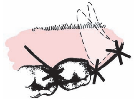
Common sites for sutures following maxillary third molar removal