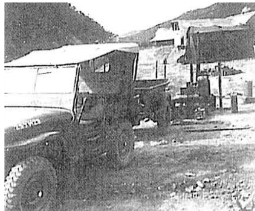
279. N Z. dental jeep and Surgery in the background.

The unit then returned to Korea and the 10 Transport Coy in August 1953 and treated all personnel at that location (near Tokchon). The unit then moved in October 1953 to the NZ Artillery.