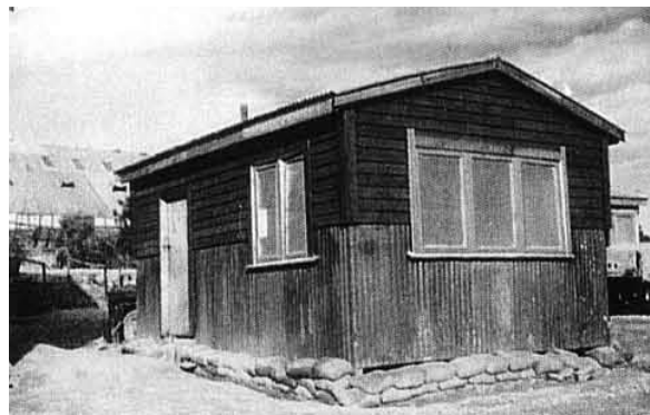
280. N.Z. fixed dental facility.

Regiment now located in their truce-time position on the northern bank of Imjin River and near the Pin Trail Bridge. A permanent surgery was built during 1954.