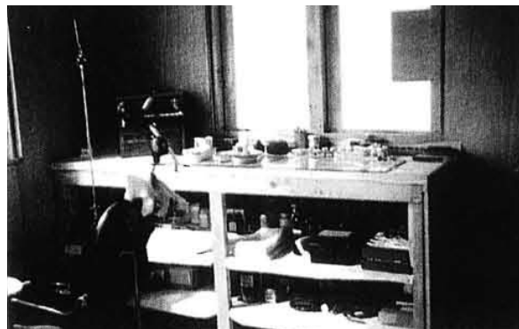
281. Inside of the dental facility.