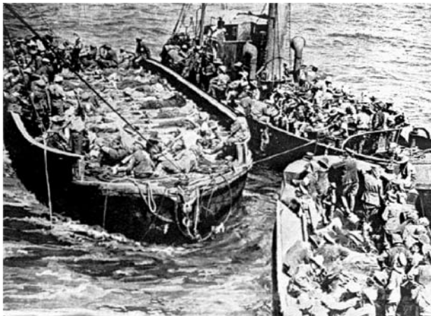
Seaward evacuation of wounded by barge from Anzac Cove, Gallipoli Australia War Memorial, C02679

witnessed at Gallipoli occur again under the modern banner of sea basing? Will a proposed diminution of medical assets (a “reduced medical footprint”) accompanying expeditionary forces inserted from sea bases allow critical, life-threatening wounds to be attended to adequately? If all that is available ashore is a meagre casualty-sorting capability, and no efficient medical regulating network is established, will the results be any different from those experienced at Gallipoli?