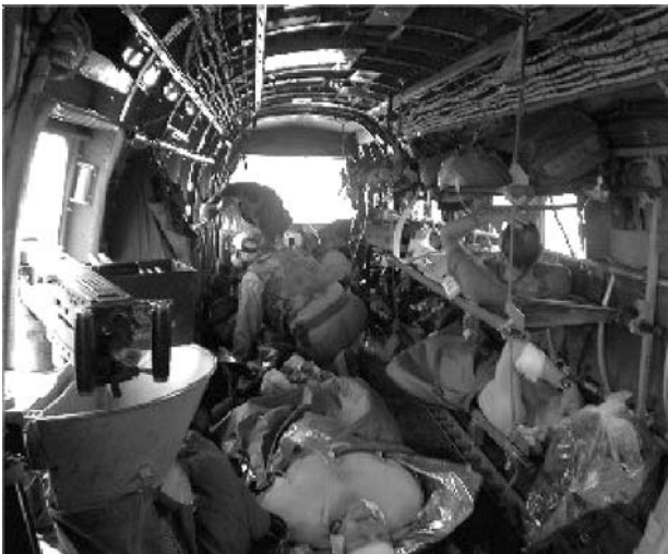
Casualties being evacuated by CH-46, IRAQI FREEDOM U.S. Navy

How can patients evacuated from a battlefield to a sea-based medical entity be properly routed to the facility best suited to their specific needs? Absent a well practiced and smoothly functioning casualty-distribution system, supported by advanced and networked communications, the growing proportion of surviving casualties with severe wounds are likely to find themselves not in the seaborne medical facility best prepared to treat their specific injuries but in the less capable facilities of amphibious assault ships. Ideally, a sea base would include MPF(F) ships with modules capable of advanced neurosurgery to manage brain and spinal cord damage and of vascular surgery to treat complicated blood-vessel injuries. Clearly, time expended transferring patients with such devastating injuries, without knowledge of their specific needs, from a battalion aid station to a marginally staffed facility aboard an LHD could be fatal, or at least sharply lessen prospects for recovery, and consume limited resources unnecessarily (see figure).