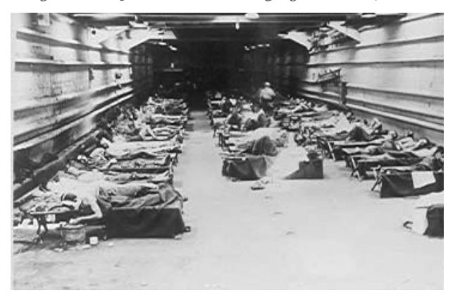
An LST tank deck with casualties (U.S. Navy Bureau of Medicine and Surgery Archives, BUAER 435557)