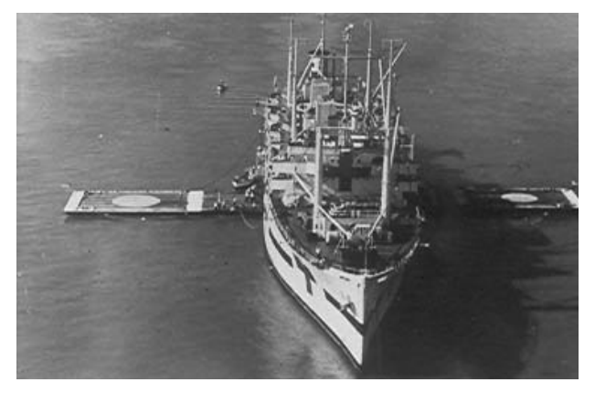
USS Haven at Inchon, 1952

to Japan, providing care en route, but Korean conditions made them far more valuable as reararea hospitals. Some shuttled between Korean ports as mobile hospitals; others remained in port for considerable periods conducting clinics similar to those of land-based facilities. Patients were winched aboard from docks or from lighters and landed in helicopters. USS Haven (AH 12), however, arrived in Inchon Harbor without a flight deck; its innovative commanding officer improvised a deck with pontoon sections obtained from the Army, mooring them perpendicular to the anchored ship on both sides and equipping them with warning lights, wind-direction indicators, and firefighting equipment. Rope ladders and temporary gangways provided access. Up to four helicopters could be landed and their casualties brought aboard ship with litter hoists.<sup>16</sup>