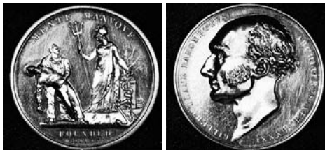
Royal Navy Gilbert Blane Medal (obverse and reverse)

have been awarded the Gilbert Blane Medal. 26 First awarded in 1830, the Blane medal is still awarded to Royal Navy medical officers “who, to a degree which is considered worthy of recognition, have brought about advances in any branch of medicine in its application to Naval service, or who have contributed to an improvement in any matters affecting the health or living conditions of Naval personnel.” 27