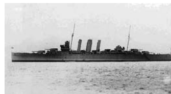
HMAS Australia, c1932-3 25