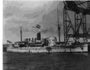
HMAS Moresby at Bowen QLD, 1928. 20

Surgeon Lieutenant Lockwood was then posted to the hydrographic survey vessel HMAS Moresby on 18 September 1925 and spent the next 18 months on the Great Barrier Reef. 19