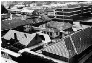
RAN Hospital HMAS Cerberus, 1940s.