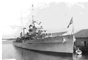
HMAS Hobart (then HMS Apollo) at Miami Florida, February 1938

At that time Hobart was engaged in escort duties on the Australia Station, including convoys in January and April from New Zealand. Following exercises in Port Philip Bay she returned to Sydney for a short refit, before sailing for the Mediterranean on 20 June to replace her sister Perth , after the latter had been damaged off Crete the previous month. 32