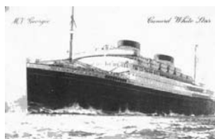
Postcard RMS Georgic, 1930s 35

En route through the Gulf of Suez, Hobart went to the aid of the 27,000 ton transport Georgic , after she was dive-bombed on the night of 13-14 July with 800 Italian internees aboard while anchored off Port Tewfik. 33 Georgic had been hit aft twice, resulting in a fire and exploding ammunition, and numerous casualties including 63 fatalities. 34