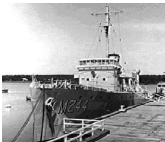
Ex-HMAS Castlemaine at Cerberus, c1973 61

In 1970 Rear Admiral Lockwood chaired a committee to conduct a feasibility study on raising the Victorian colonial naval vessel Cerberus , which had been sunk as a breakwater at Black Rock in Port Phillip Bay in 1926. This committee later formed the basis of the Maritime Trust of Australia, and it was during his tenure as vice-chairman in 1970-74 that it was gifted the WW II corvette Castlemaine , now a museum ship at Williamstown VIC. 60