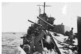
Hobart torpedo hit, 22 Jul 1943